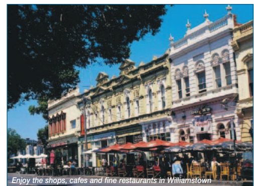
Enjoy the shops, cafes and fine restaurants in Williamstown

One of the real charms of getting to Hobsons Bay is just that, getting there! Travel by ferry from the City, get on your bike and ride, take the train or travel across the West Gate Bridge. Which ever way you come, your adventure starts the moment you leave home.